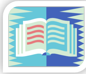
Rich reference material with practical tips, ideas, checklists and templates