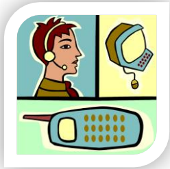
Participation via videoconference and other online tools, asynchronous and real-time